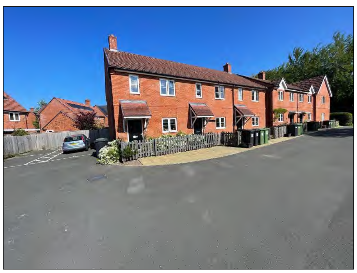
SO50 7FA 43, Savernake Way, Fair Oak, EASTLEIGH, Hampshire