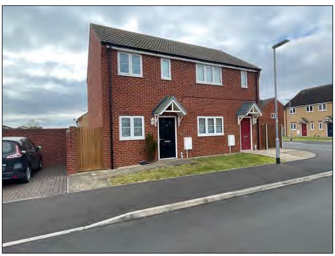
TA6 4SX 17, Springfield Close, Pawlett, BRIDGWATER, Somerset