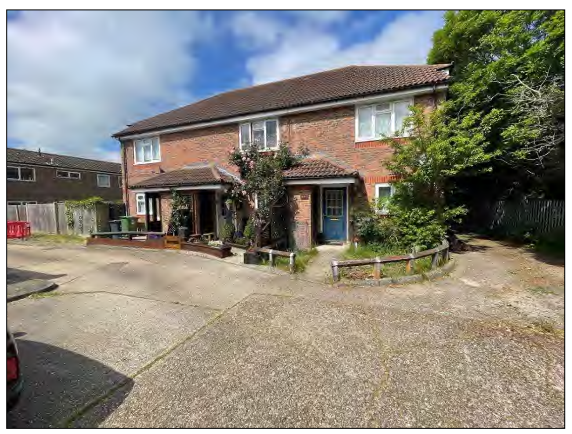
BN27 3ND 54a/b, The Holt, HAILSHAM, East Sussex