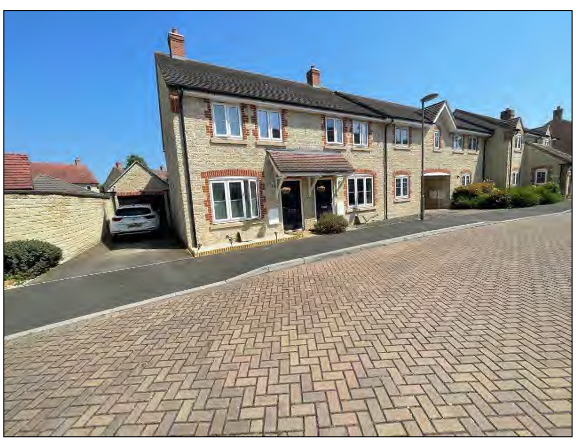
SN7 8PH 38, Nursery End, Stanford In The Vale, FARINGDON