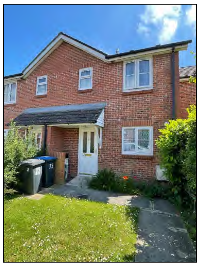
BN6 9SX 73, Western Road, Hurstpierpoint, HASSOCKS, West Sussex