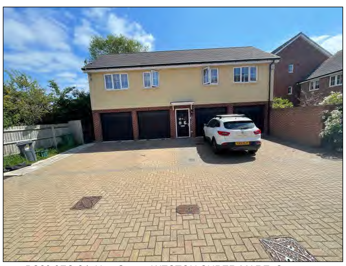
BS23 3FQ 24, Hay Grove, WESTON SUPER MARE, Somerset