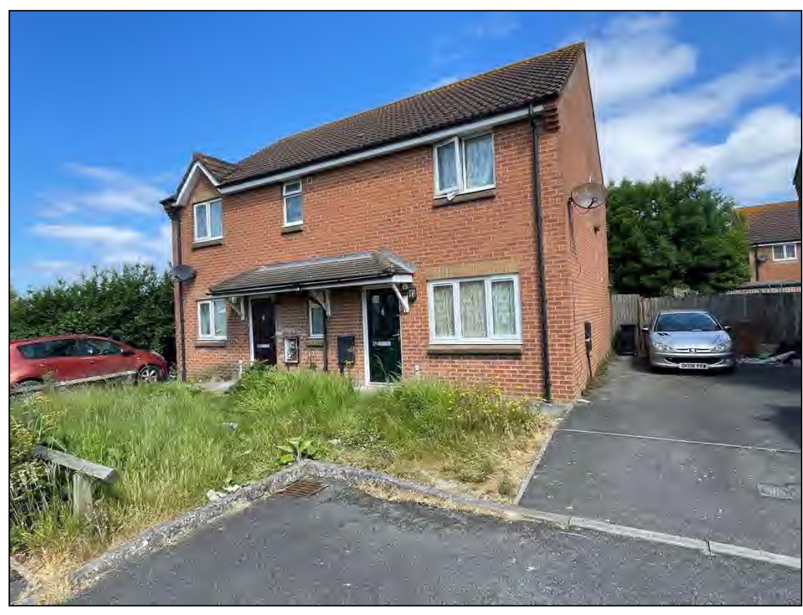
BS23 3BX 29, Brue Close, WESTON SUPER MARE, North Somerset