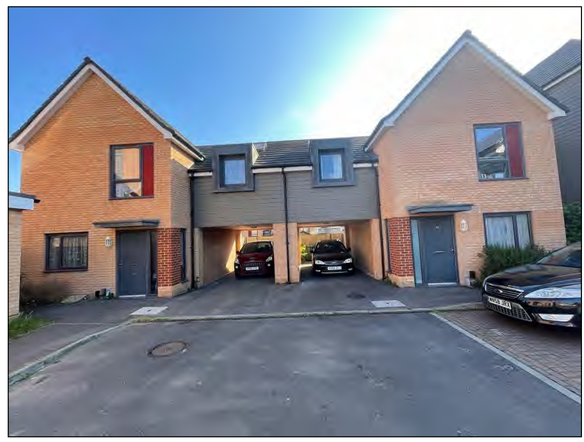
SO16 9GL 44, Buttermere Close, SOUTHAMPTON, Hampshire