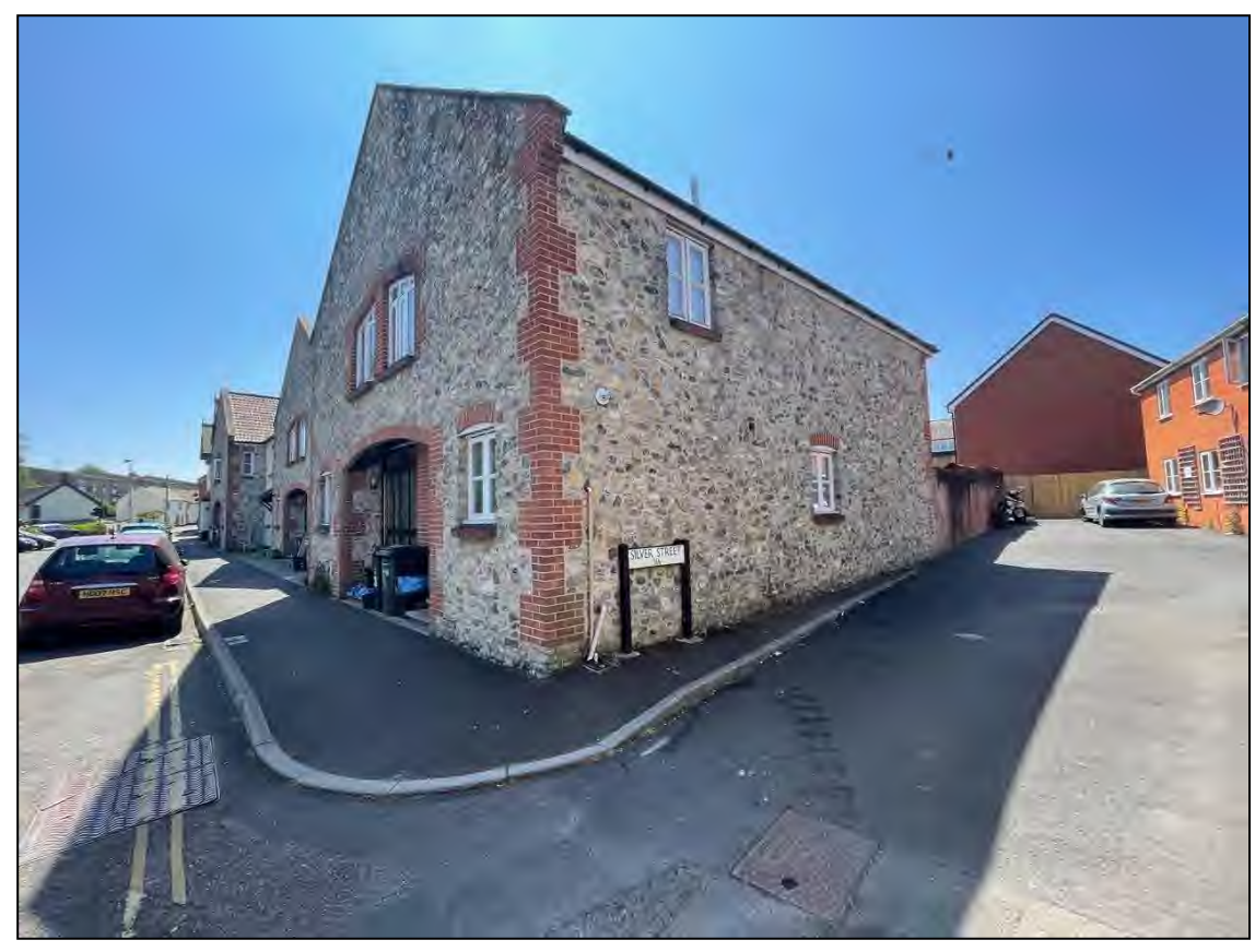
TA20 2AY Flat 3, 31a, Silver Street, CHARD, Somerset