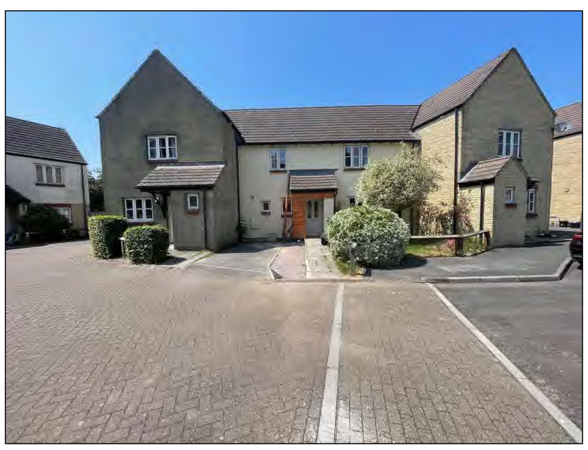
GL7 1XX 26, Smith'S Field, CIRENCESTER, Gloucestershire