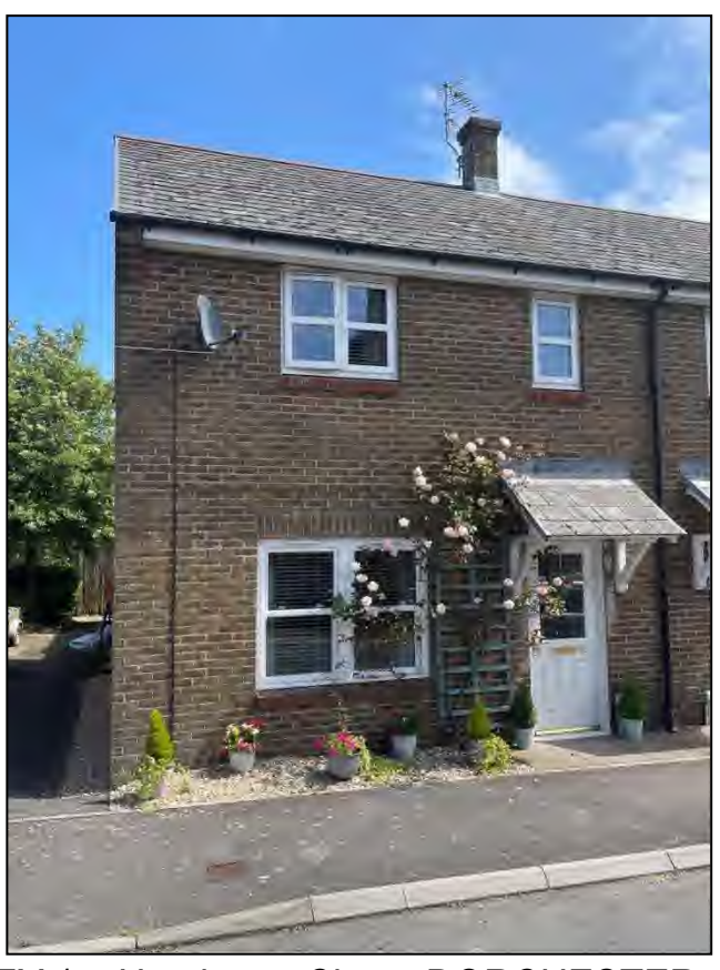
DT1 1EY 15, Heathcote Close, DORCHESTER, Dorset