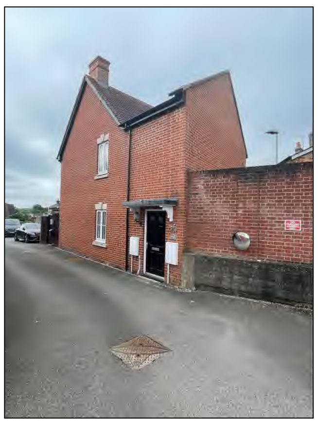
DT11 7FF 1 Acorn Court, Damory Street, BLANDFORD, Dorset