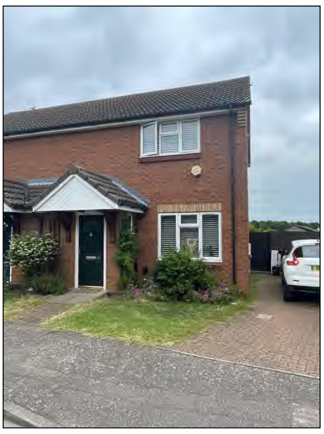
SG17 5HD 90, Bilberry Road, Clifton, SHEFFORD, Bedfordshire