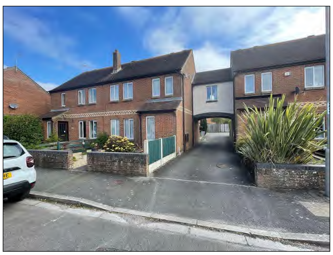
BH20 4HH 18, Folly Lane, Bells Orchard, WAREHAM, Dorset