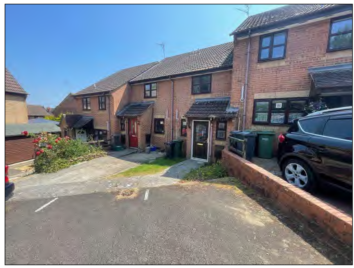
GL11 5PX 30, Bramble Drive, Kingshill Road, DURSLEY, Glos