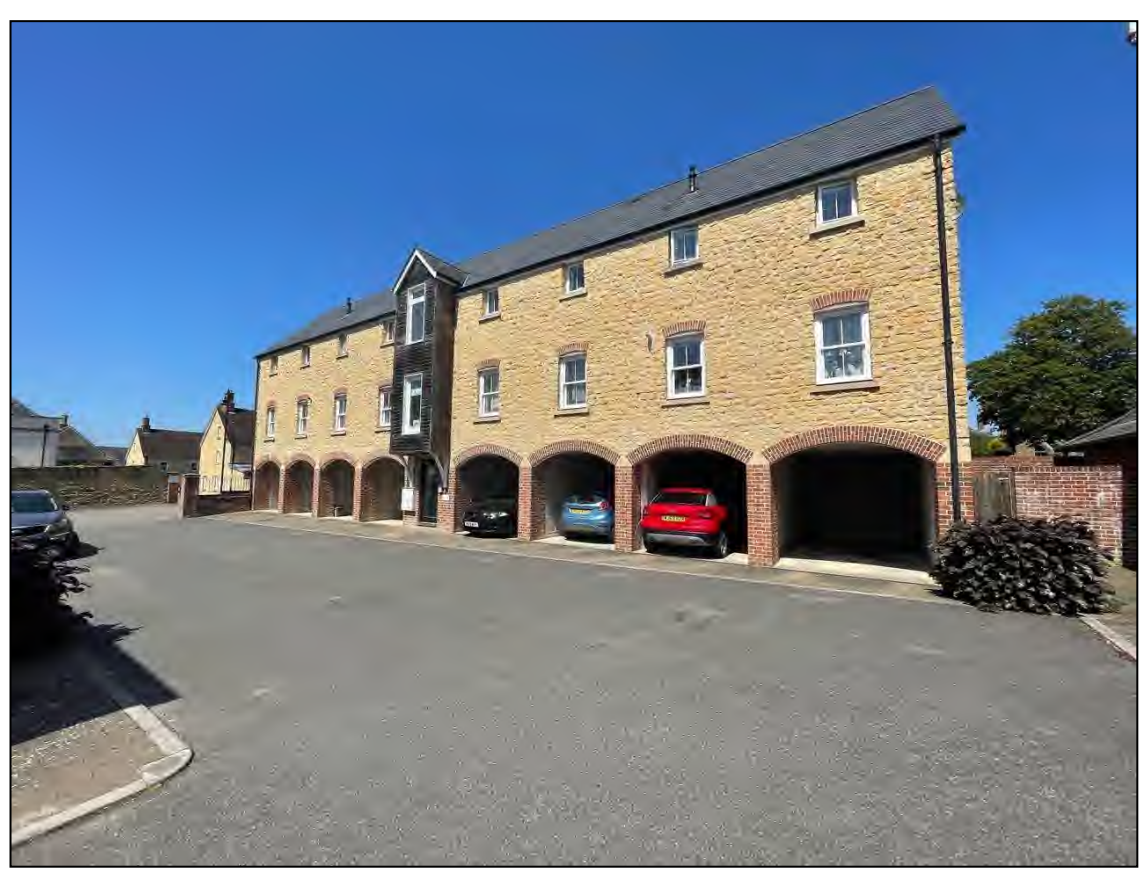
DT9 4FN Flat 1, 10 Portman Mews, SHERBORNE, Dorset