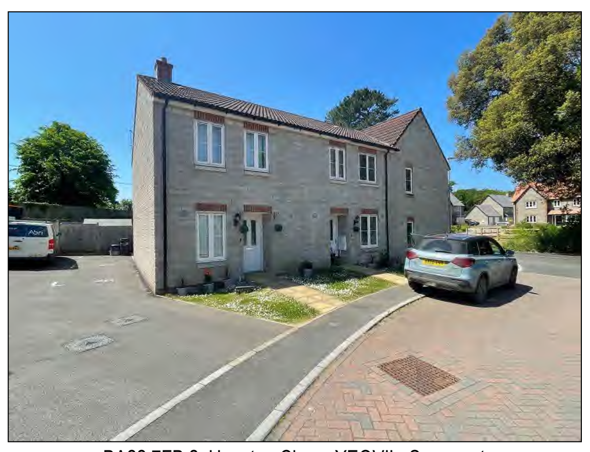
BA22 7FB 2, Hanyton Close, YEOVIL, Somerset