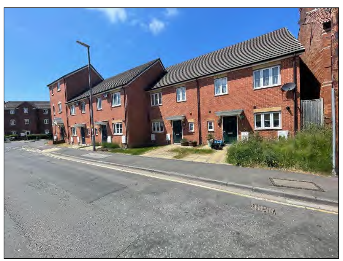
BA20 2AG 90-98, West Hendford, YEOVIL, Somerset