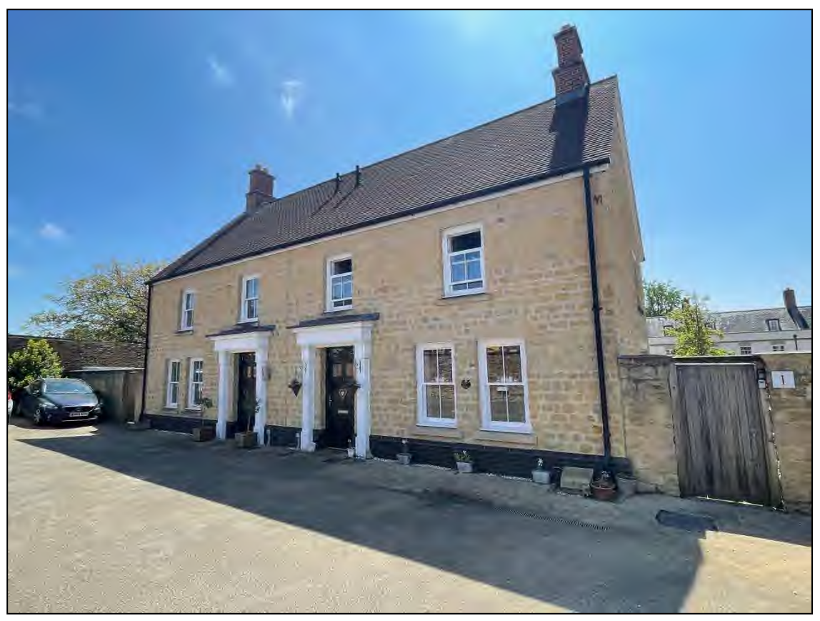
DT9 4FJ 1, Portman Square, SHERBORNE, Dorset