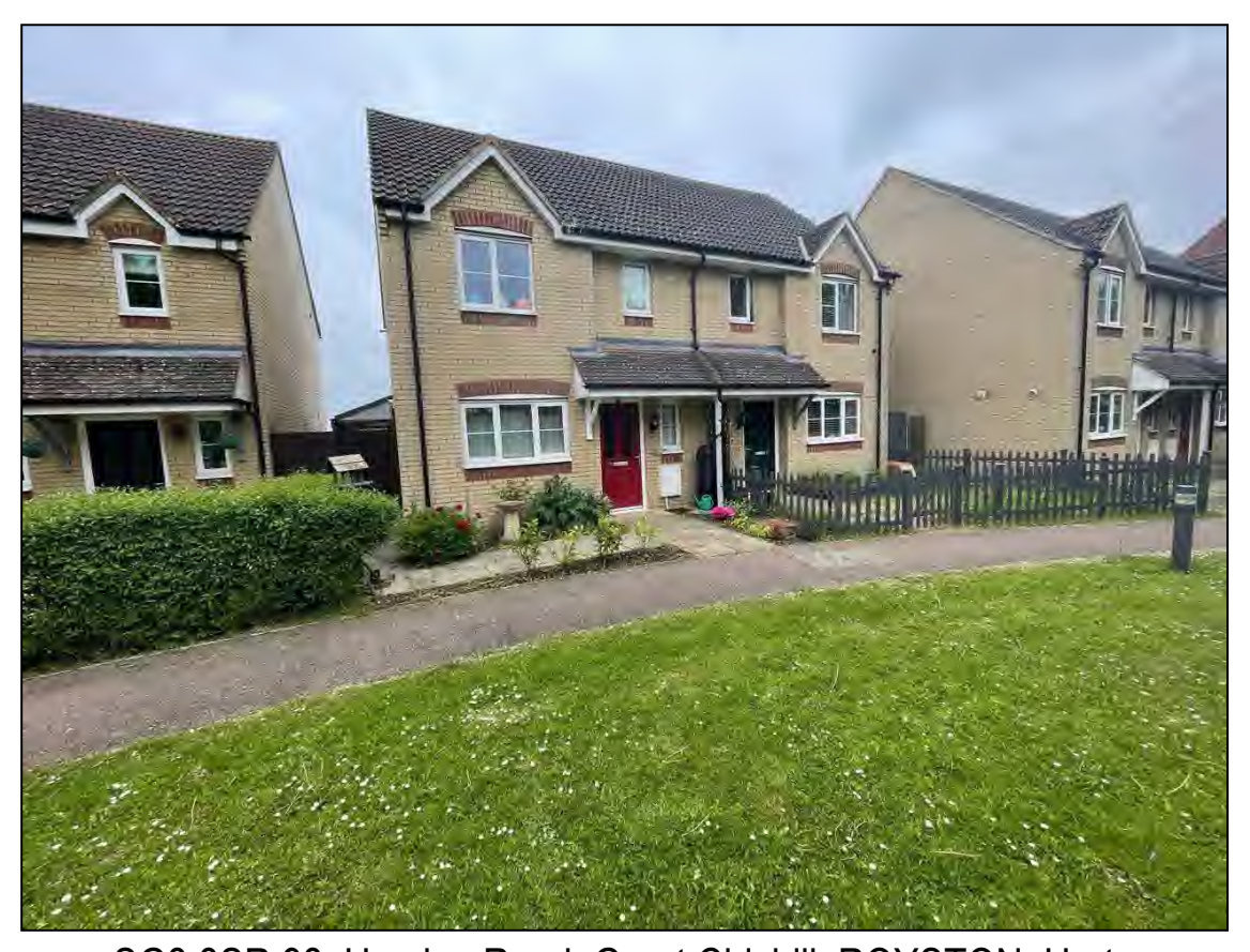
SG8 8SR 98, Heydon Road, Great Chishill, ROYSTON, Herts