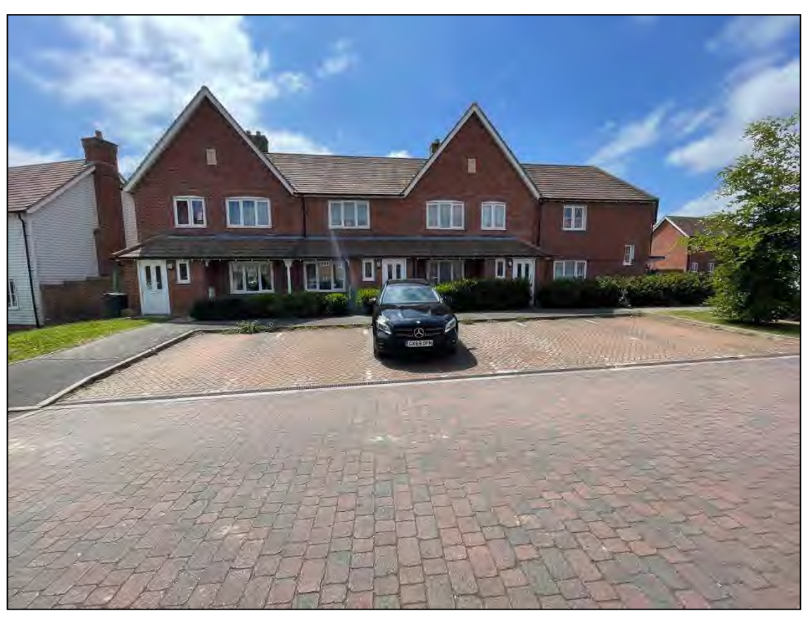
BN26 6FH 3, Kensington Way, POLEGATE, East Sussex