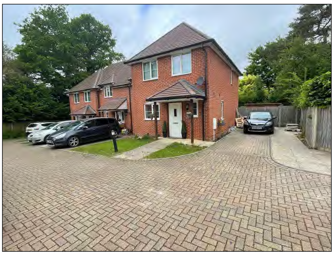
TN20 6DH 2, Woodland Place, MAYFIELD, East Sussex