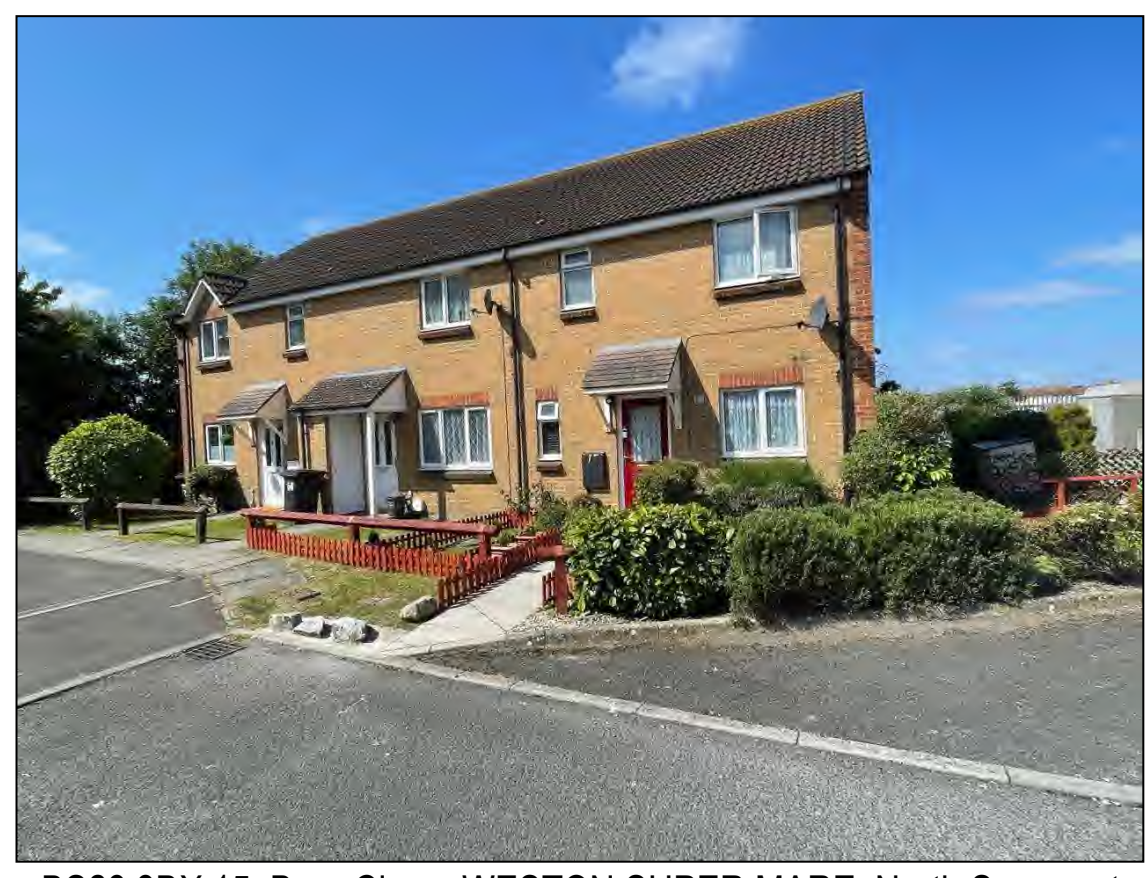
BS23 3BX 15, Brue Close, WESTON SUPER MARE, North Somerset