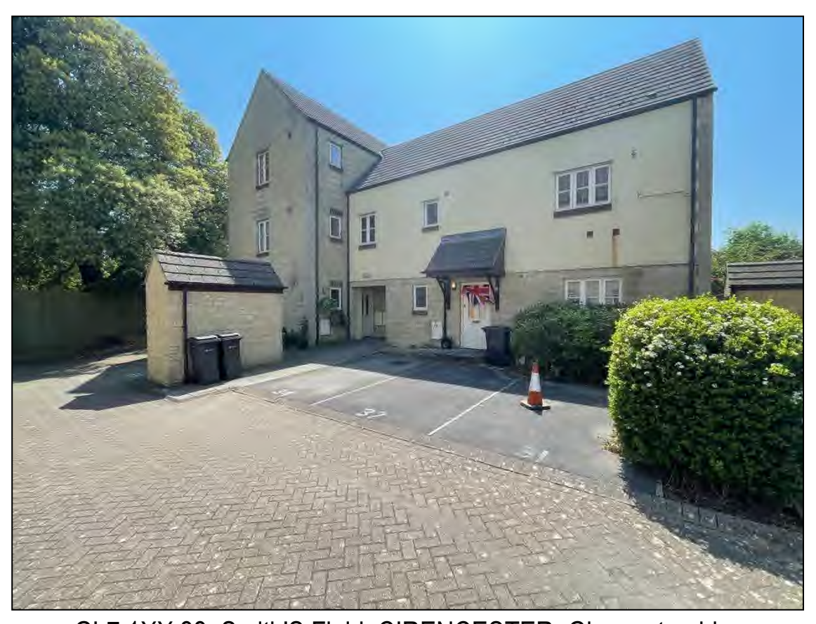
GL7 1XX 33, Smith'S Field, CIRENCESTER, Gloucestershire