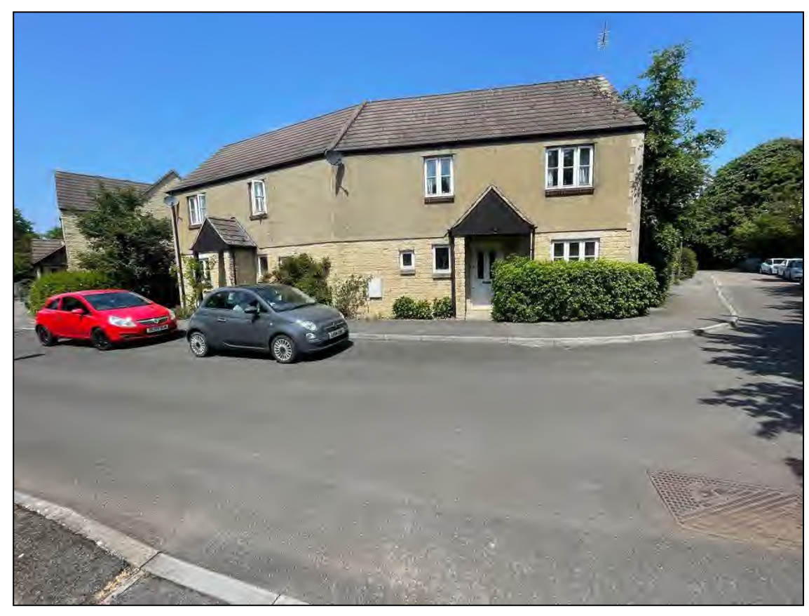
GL7 1XX 17, Smith'S Field, CIRENCESTER, Gloucestershire